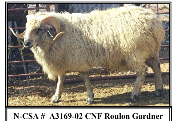
N-CSA # A3169-02 CNF Roulon Gardner

Animals can be horned or polled in either sex. Multiple horns (2-6) are not uncommon.