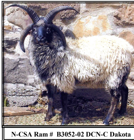
N-CSA Ram # B3052-02 DCN-C Dakota

The sheep have a strong flocking instincts and are very intelligent. Most Navajo-Churro are a-seasonal breeders and mature early so two lamb crops per year are likely if rams are left with the ewes year round. The ewes lamb easily and are fiercely protective. Twins and triplets are not uncommon. Ewes seldom require assistance of any kind in lambing. Both ewe and lamb seem to know each other instantly. The lamb suckles within 10-15 minutes and is ready to travel by the mother's flank within that same short time.